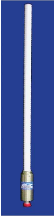
BRS360-698-6-T0-D 722 MHz

Rugged 700/850 MHz Omnidirectional Antenna